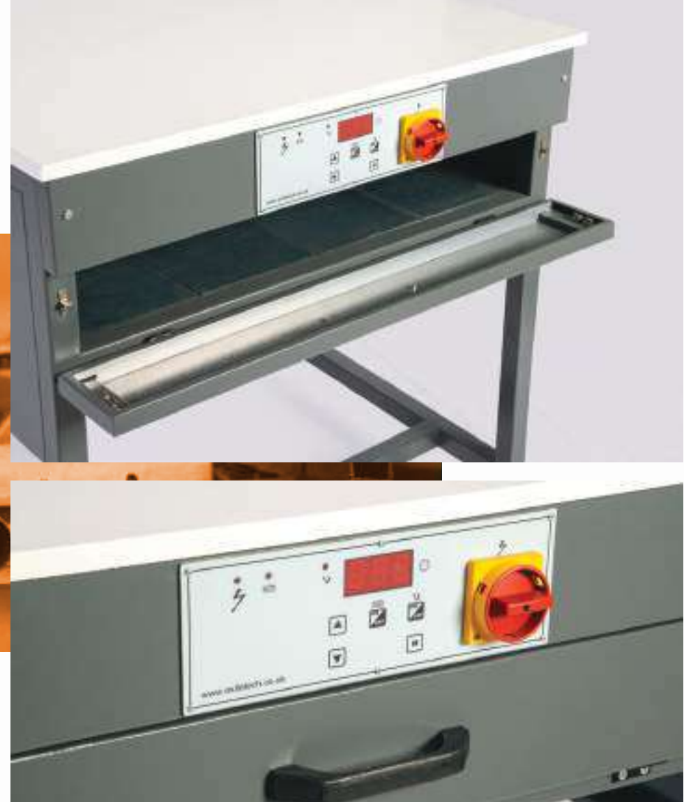
Digital Controls with 10 x Memory Exposure Timer Presets

The full LED array exposes the entire screen at once, ensuring quick and even curing of the emulsion. As a stand, this equipment provides a level, solid base to ensure proper operation of the FREEStyler. Set on wheels, the EXPOSE DTS can quickly and easily be moved as needed. EXPOSE DTS supports a wide range of screen frame sizes up to 41 x 30" (110 cms x 80 cms).